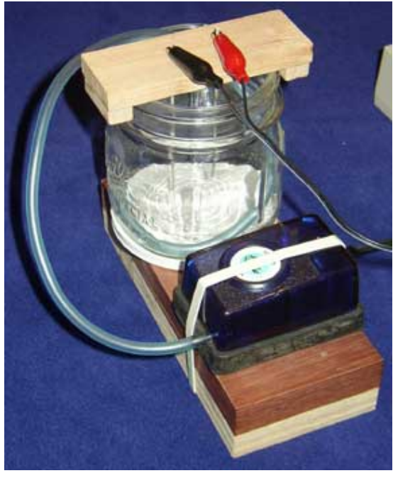
The Generator III hooked up to surge protector.